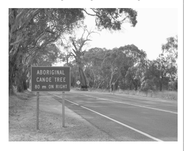
Another canoe tree, located near Goolwa SA

37 acre farm close to the SW of corner of Waverley Road and Jells Road was similarly honoured in 1942, after a brave attempt to escape a POW camp.