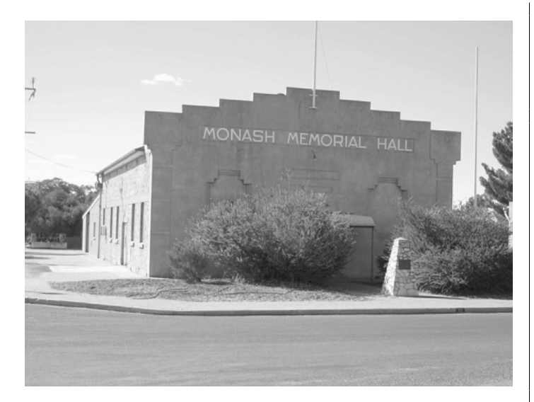
The monument is here, outside Monash Memorial Hall. Monash is a little town a few kilometres north of Berri in South Australia.