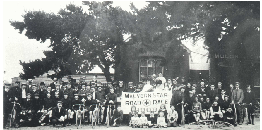
The Malvern Star Cycle race used to start at the Mulgrave Arms Hotel. This was the 1909 race.

Fifty years later it was still not forgotten. The Mulgrave Arms was the turning around point for the 1956 Olympic marathon. Unfortunately by then its days were numbered,